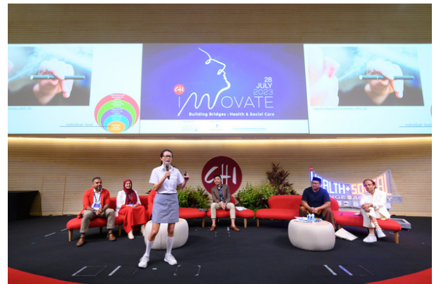
FaceOff tackled the motion on “Singaporeans’ health behaviours will only change with governmental interventions”.